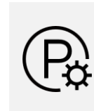
Parking Pay Station