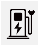
EV Charging Station

Operating outdoor kiosks is not for the fainthearted. The average touch display just won't do because of the numerous 'moving parts' in an outdoor environment. You would need both brains and brawn for successful deployment. To take on these physical challenges, General Touch has come up with the DuraBrite series outdoor high bright monitors. Currently available in sizes from 7 to 32 inches, the state-of-the-art DuraBrite series have been carefully designed and produced with innovative enhancements and capabilities. These enhancements would facilitate optimal performance in adverse environmental conditions, making the series ideal for use in payment terminals, self-service kiosks, EV charging stations, ticketing machines, vending machines, outdoor signage and more.